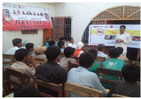
Rural Development Foundation (RDF)