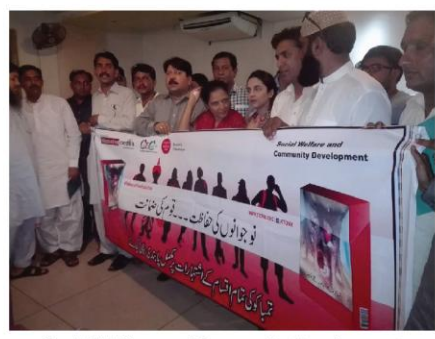
Social Welfare and Community Development Burewala, Punjab