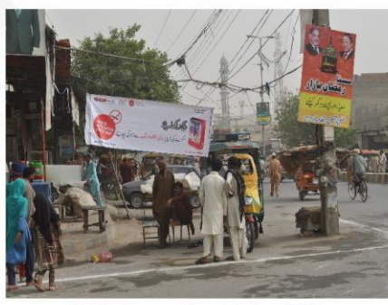
Public Support Organization (PSO) Lodharan