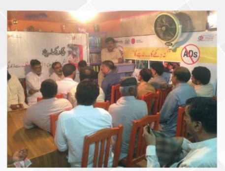
Community Development Foundation Pakistan Sakrand