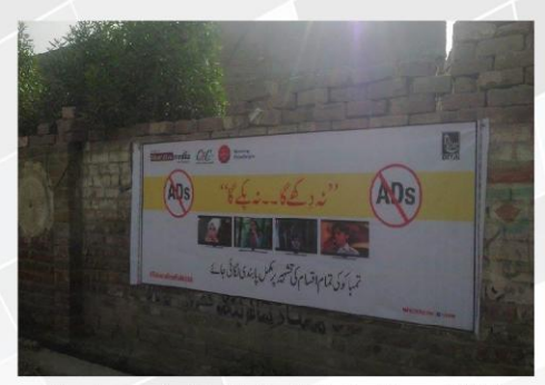
Development of Institution & Youth Alliance (DIYA) Sakrand