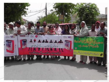
Real Hope Vehari, Punjab