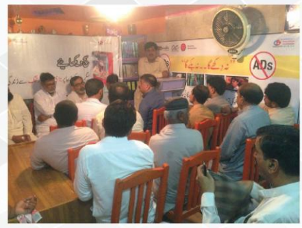
Community Development Foundation Pakistan Sakrand