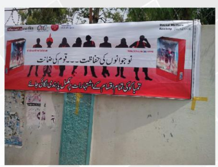
Community Development Foundation Pakistan Sakrand