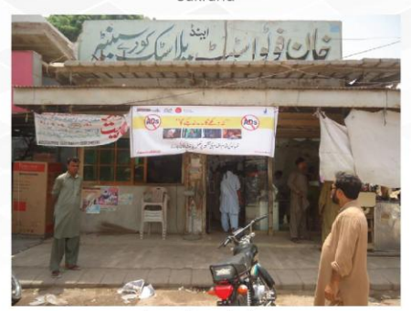
Peace Foundation Quetta