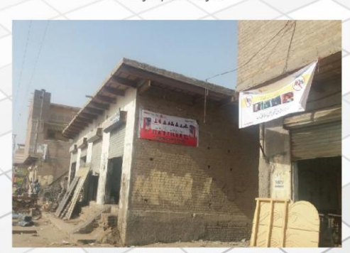
Kainaat Development Association (KDA) Kashmore, Sindh