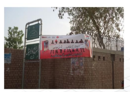
Youth Development Organization (YDO) Rajanpur, Punjab