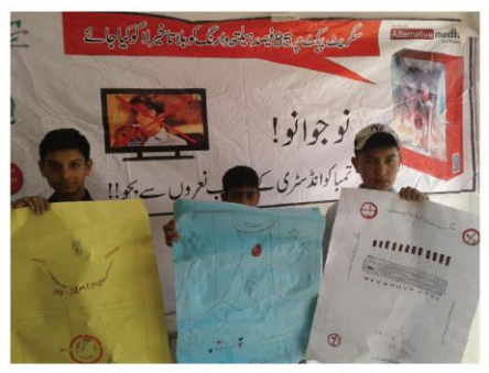
United Development Organization Kalar Syedaan, Punjab